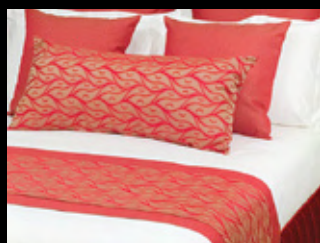
Bed Runner and matching Cushion Accessories

(Note : some of these products are required to be displayed with a white jacquard Quilt Cover or Third Flat Sheet. Quilt Covers and Third Sheets must be laundered between every guest, which can become too expensive or labor intensive for tariff restricted properties.)