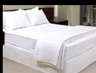
Narrow Quilted Woven Coverlets